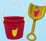
Pail & Shovel